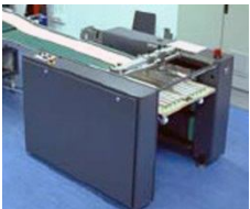
High Pile Vertical Stacker