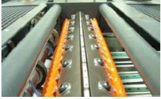
Double Shear Cut Blades for Chip Cut