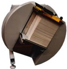
High Pile Stacker Turner