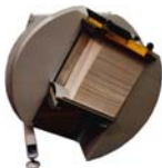
High Pile Stacker Turner