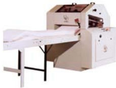
Standard Shingle delivery