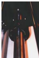
File Hole Punching