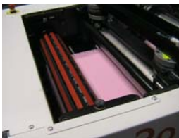
Perforating and Die Cutting