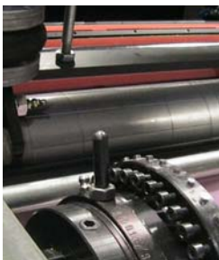
Fully configured unit with Punching, Die Cutting and Horizontal Perforating Cylinder